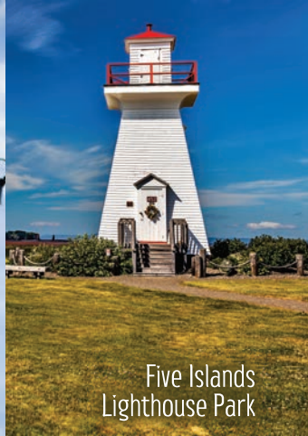
Five Islands Lighthouse Park