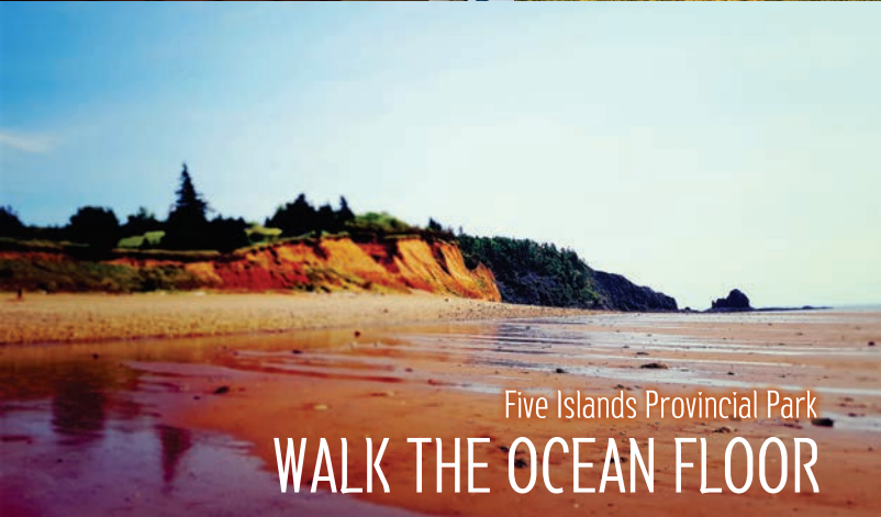
Five Islands Provincial Park WALK THE OCEAN FLOOR