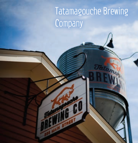
Tatamagouche Brewing Company