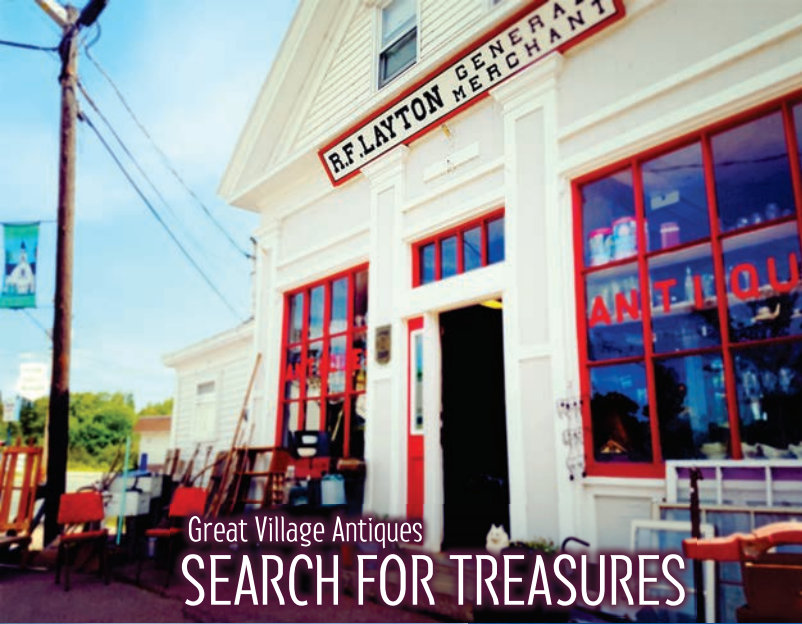
Great Village Antiques SEARCH FOR TREASURES