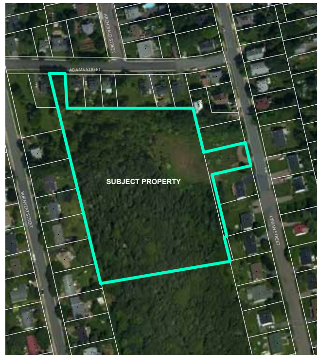
Air Photo Showing the Subject Properties and Surrounding Area

This development consists of two properties, PID nos. 20188645 and 20438784. PID 20188645, is also identified as 32 Adam Street. The property has an area of 32,453 m 2 (8 acres) though only 17,632 m 2 (4.4 acres) of this property is to be developed as part of this proposal. This parcel has 13.15m (43 ft) of frontage on Adam Street. PID 20438784, also identified as 118 Lyman Street, has an area of 973 m 2 (0.24 acres) and 21 m (69 ft) of frontage on Lyman Street. The total area of the combined subject properties to be developed is 18,605 m 2 (4.6 acres). The development will be accessed from Lyman Street, therefore it will use 118 Lyman Street as its civic address. The subject properties are zoned General Residential (R3) and are situated within the General Residential Future Land Use Designation. There is currently no development on the property. The property is mostly forested although the portion fronting on Lyman Street is mostly grass and has been filled in. The lot has an overall steep grade, and there is a deep gully at the northern end of the site. The proposed development will occupy the southern portion of the subject lands where the topography is better suited for development. The subject property is situated in a residential area mostly consisting of 1 to 2 storey single unit dwellings, with some multi-unit dwellings as well.