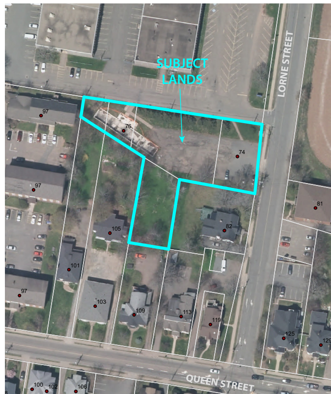
Air Photo showing the subject lands and surrounding area

The subject lands consist of four separate parcels and a portion of a fifth located just northwest of the intersection of Queen and Lorne Streets. The affected lands include the rear portion of 109 Queen Street and four properties at 74/76 Lorne Street that would have been the location of the former Colchester Food Bank. These parcels are also identified as PID nos. 20183455, 20183414, 20183406, 20434379, and 20434387 respectively. 109 Queen is currently developed and contains a four-unit converted dwelling. The front portion of 109 Queen, the portion containing the existing converted dwelling, is not included in this application.