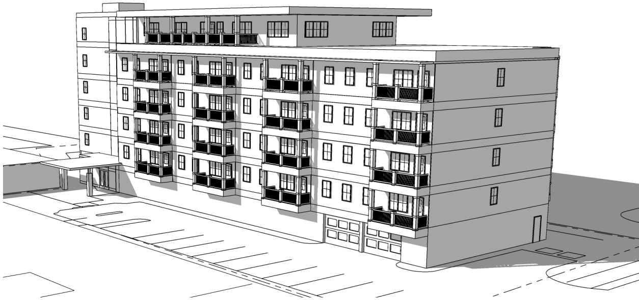
Conceptual Rendering of the Proposed Development