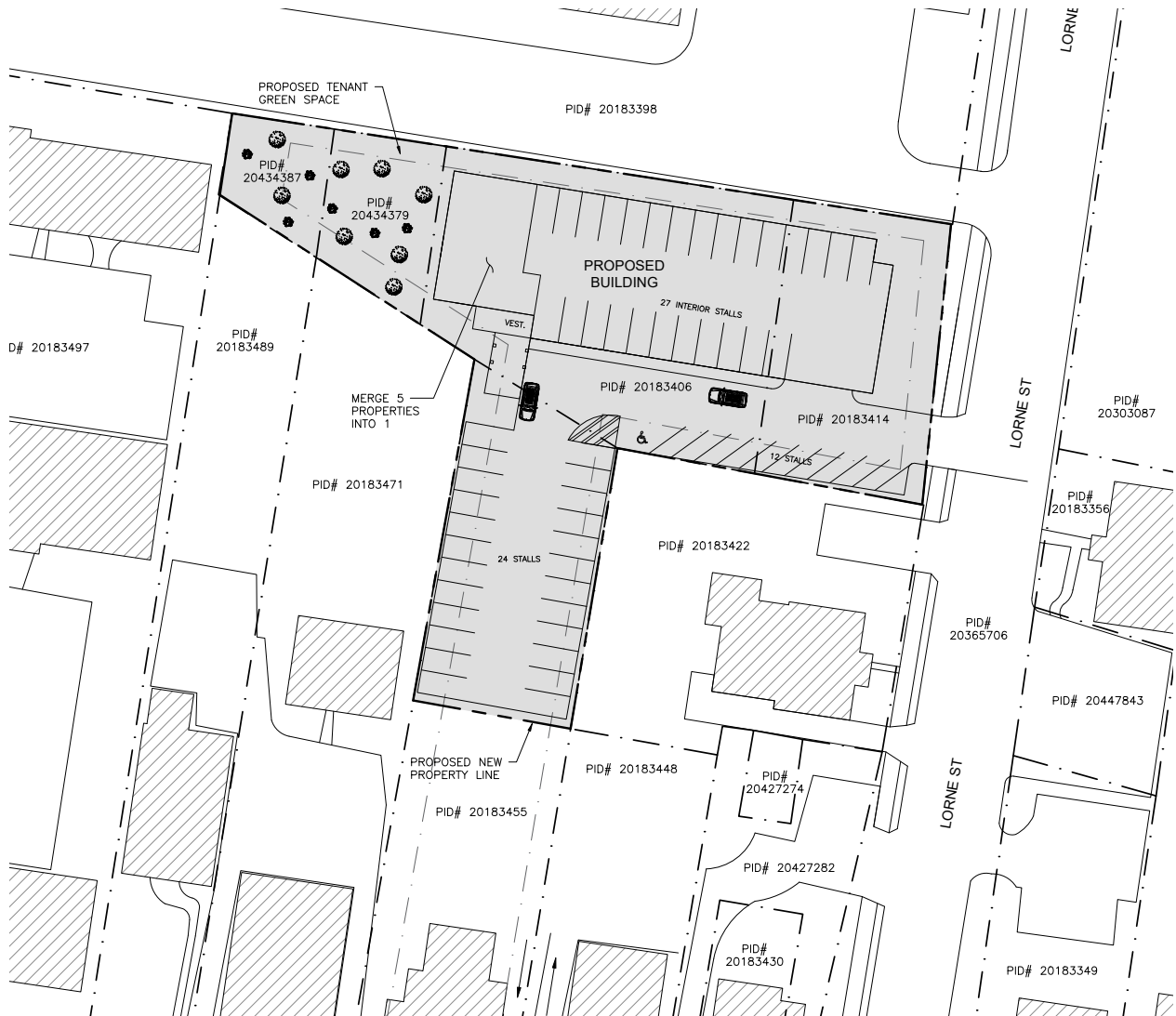
Conceptual Site Plan of the Proposed Development