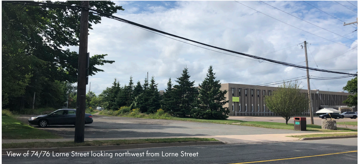
View of 74/76 Lorne Street looking northwest from Lorne Street