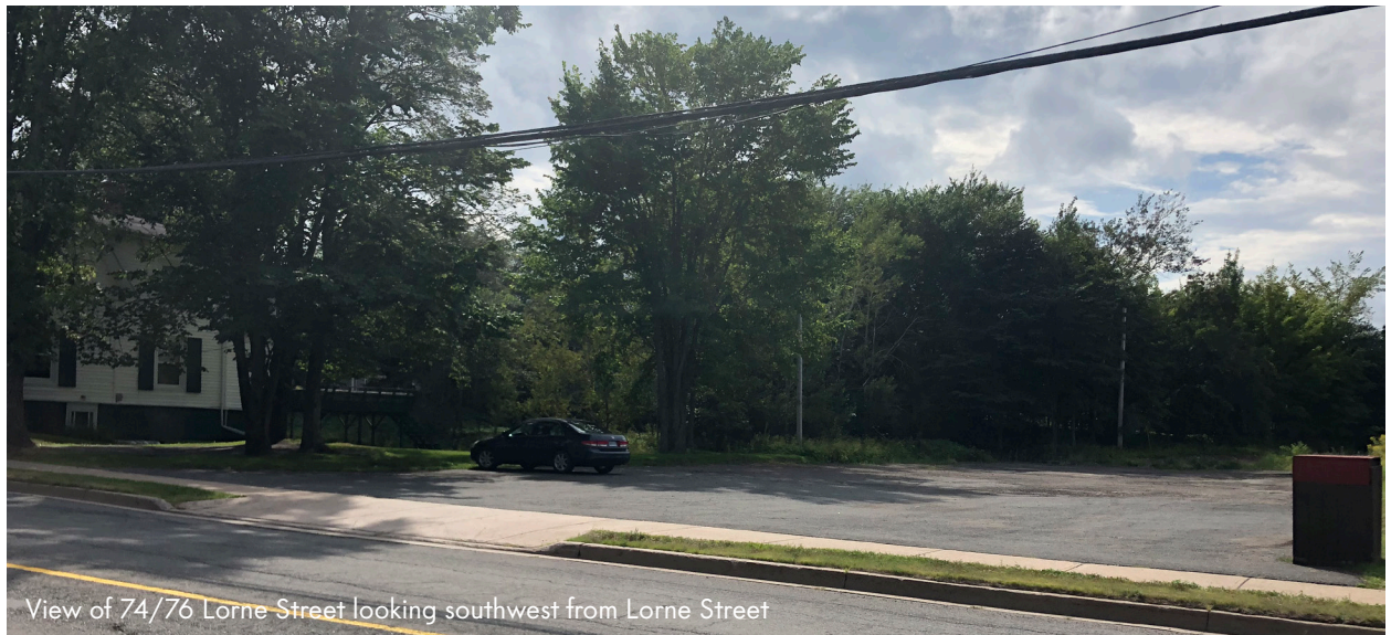
View of 74/76 Lorne Street looking southwest from Lorne Street