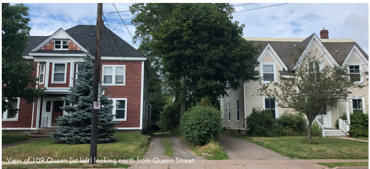
View of 109 Queen (at left) looking north from Queen Street