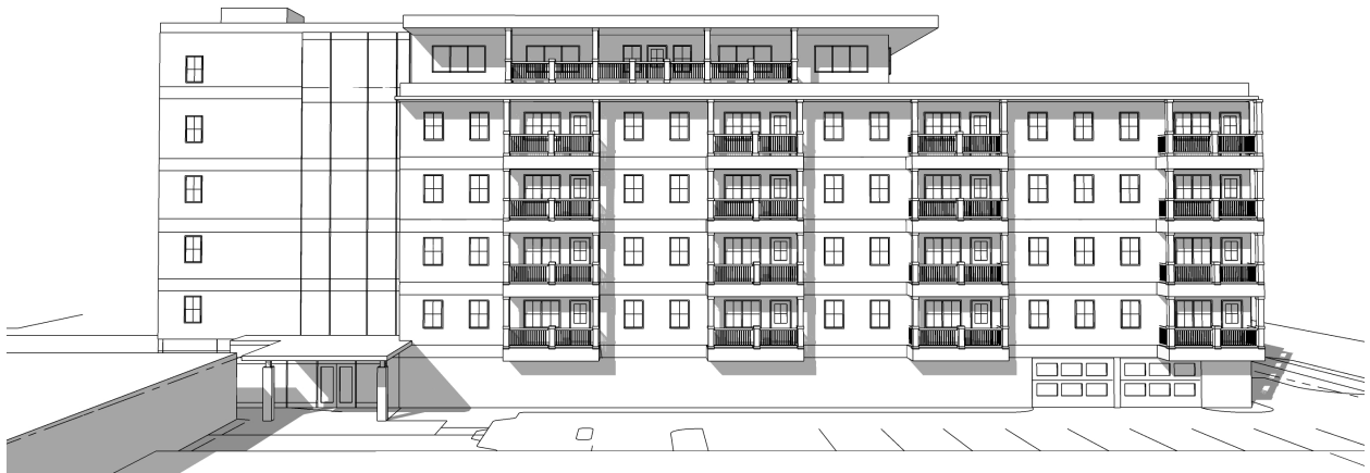
Conceptual Rendering of the Proposed Development