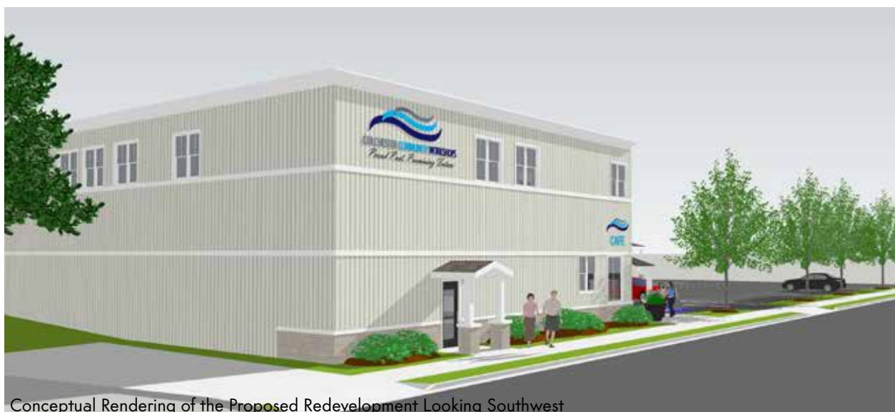
Conceptual Rendering of the Proposed Redevelopment Looking Southwest