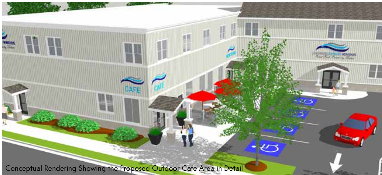
Conceptual Rendering Showing the Proposed Outdoor Cafe Area in Detail