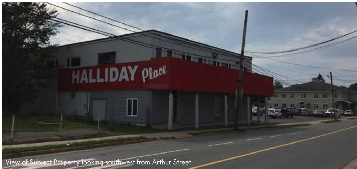
View of Subject Property looking southwest from Arthur Street

Arthur Street. The property is zoned Downtown Commercial (C1) and the property is located on the edge of Truro's traditional downtown commercial area. Development in this area consists of a mixture of commercial buildings and older homes dating from the early 1900s. Most of these older dwellings have been converted into multiple unit dwellings or commercial uses. Very few single unit dwellings remain along this portion of Arthur Street. Other nearby uses include a veterinary clinic, pizza shop, Colchester Community Workshop's existing facility, the Truro Curling Club, funeral home, and Wilson's Fuels offices.