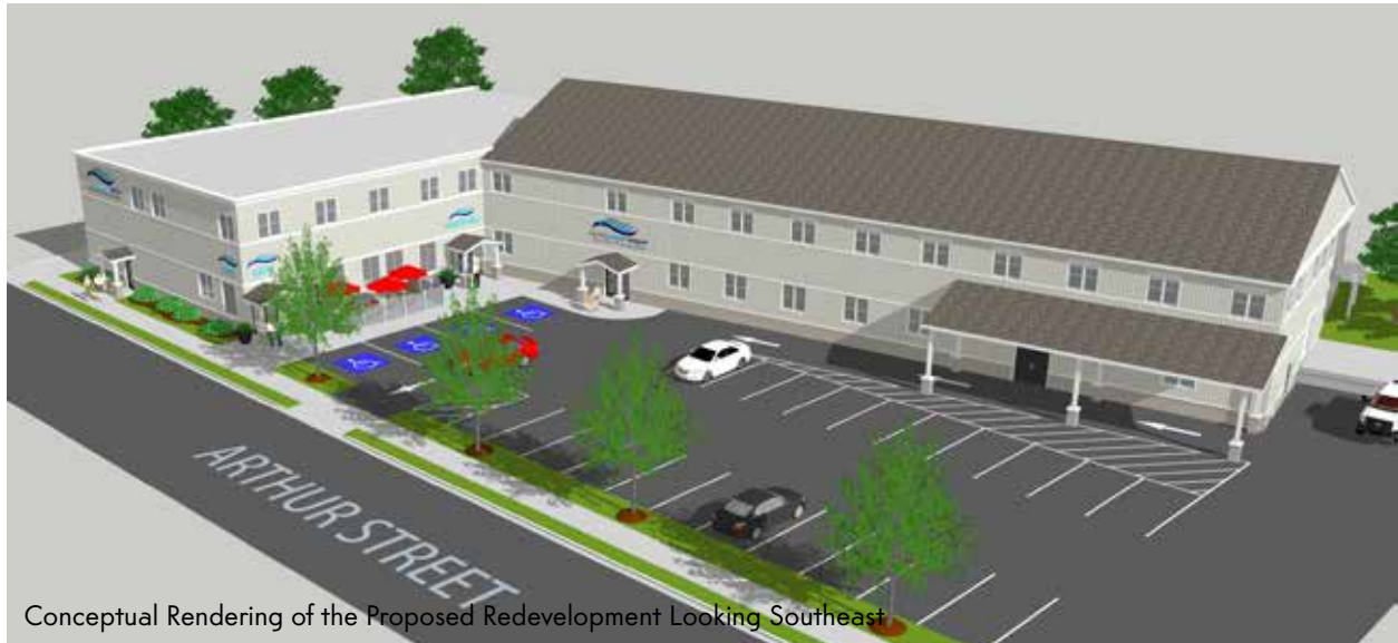
Conceptual Rendering of the Proposed Redevelopment Looking Southeast