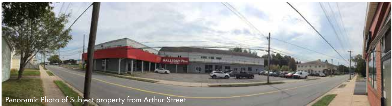
Panoramic Photo of Subject property from Arthur Street