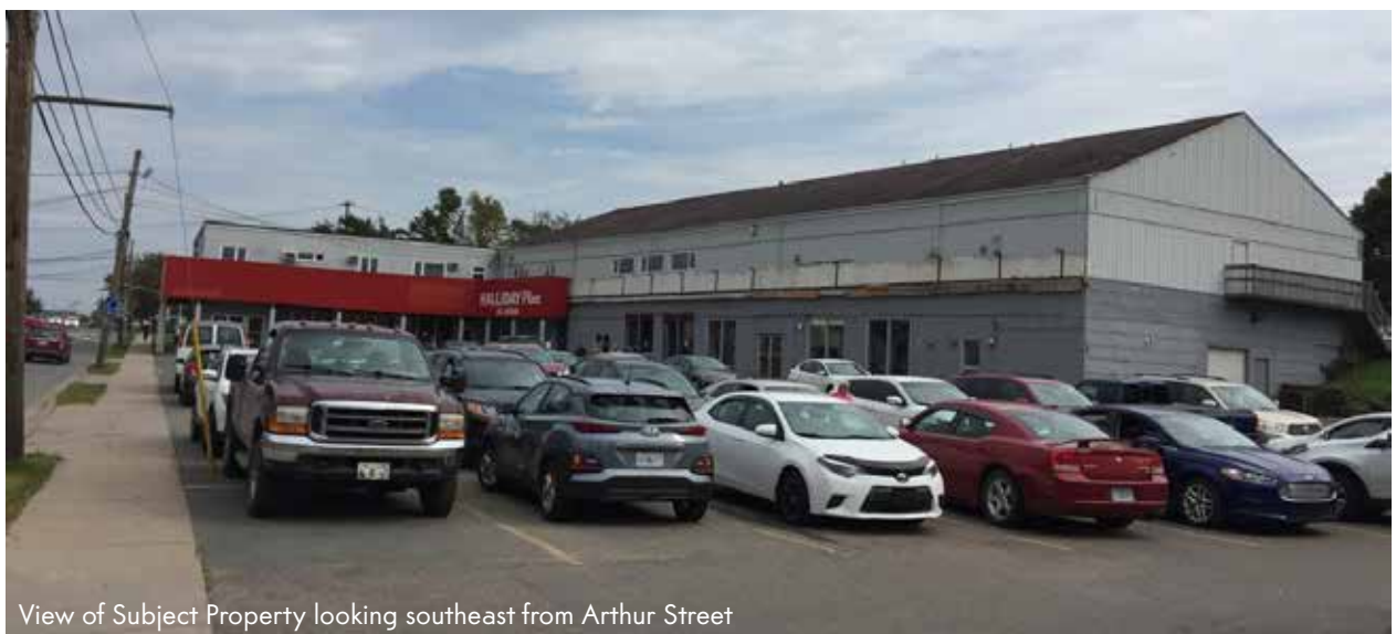
View of Subject Property looking southeast from Arthur Street