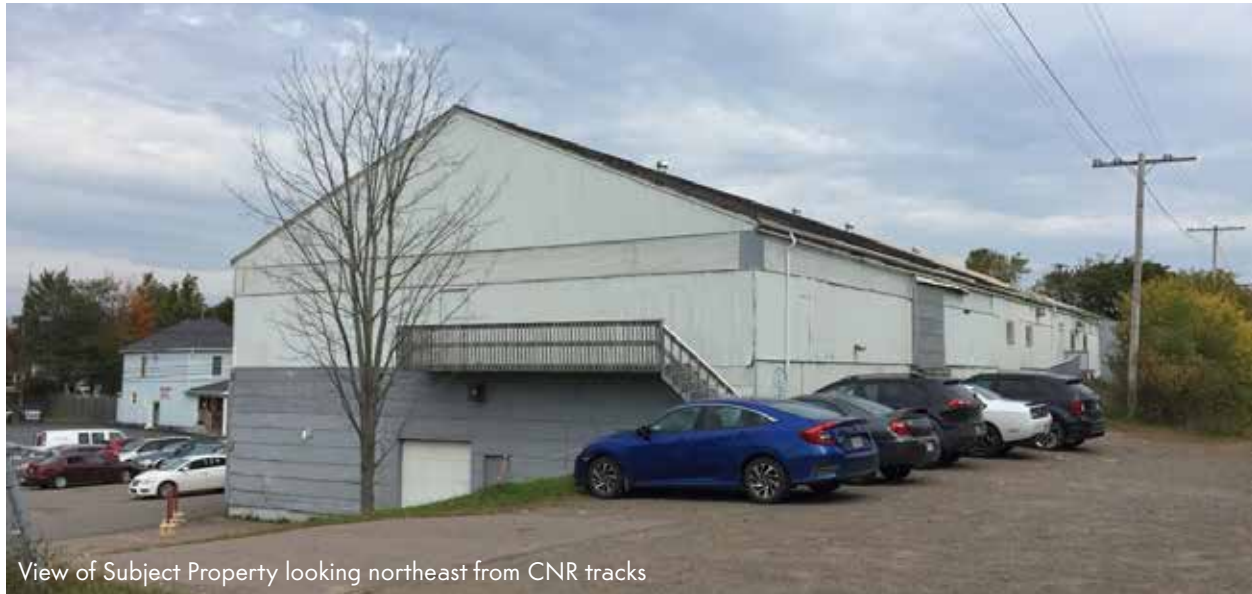
View of Subject Property looking northeast from CNR tracks