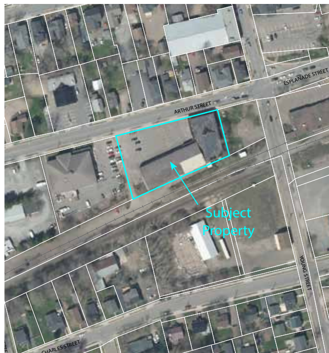
Air Photo showing the subject property and surrounding area

The subject property is 3,561 m 2 (38,329 ft 2 ) in area and has 81.7 metres (268 feet) of frontage on