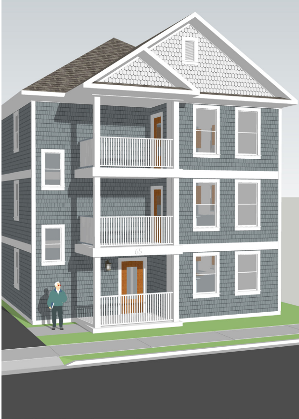
A rendering of the proposed development from Walker St.