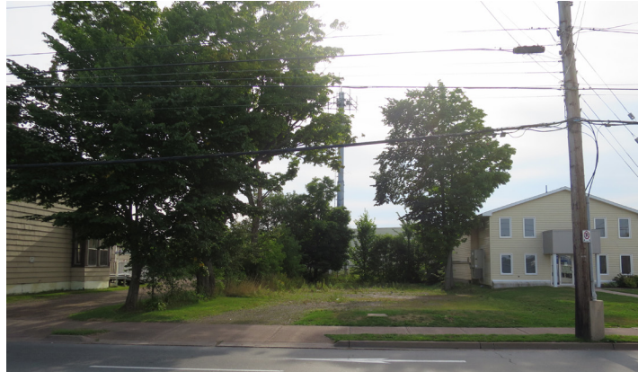
A photo of the subject property with neighbouring properties