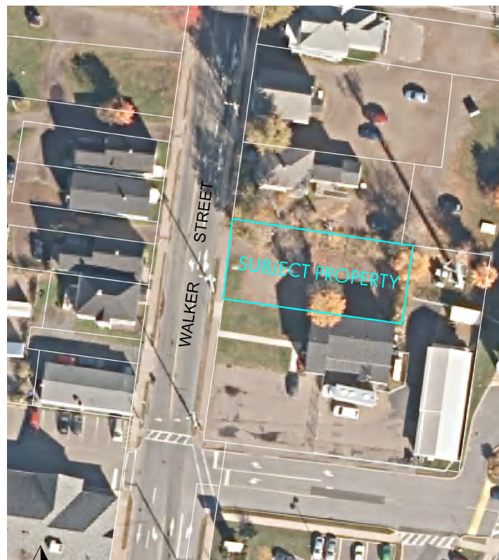
Air Photo showing the subject property and surrounding area

The applicant has submitted plans that show a 3-storey building, with 2 1-bedroom dwelling units per floor. Each dwelling unit is nearly identical at 61.9 m 2 (667 ft 2 ) per unit. The units feature balconies and 3 appliances. A shared washer and dryer are located in the basement, along with individual storage units.