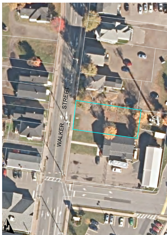
Air Photo showing the subject property and surrounding area

Wolfville Court Holdings Ltd. is seeking approval to develop a 3-storey, 6-unit residential building on the subject land. The proposed building is approximately 15.8 x 9.1 metres (52 x 30 feet) and has a ground floor area of 144 m 2 (1560ft 2 ). The proposed building is oriented towards Walker Street. A parking area is situated behind the building at the rear of the development. It is accessible via a single driveway located off Walker Street. The parking lot will have space for 6 vehicles. A conceptual site plan showing the proposed development is shown on the following page.