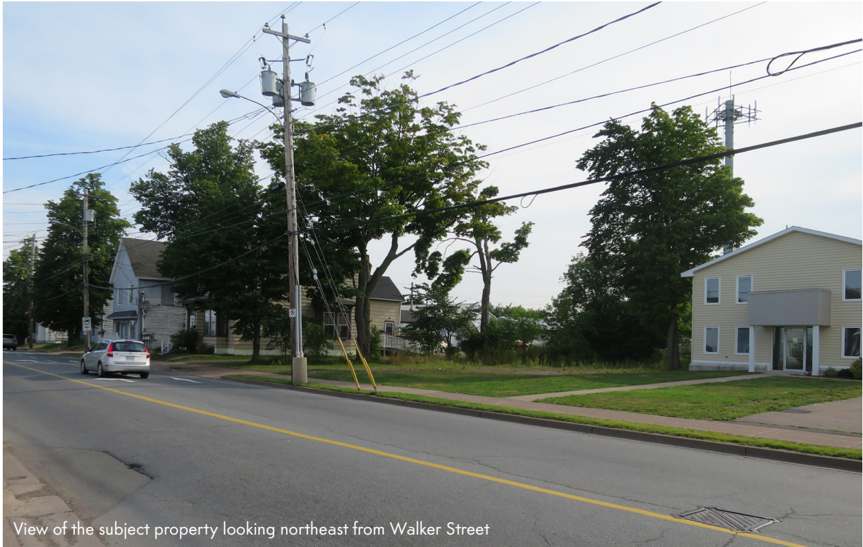
View of the subject property looking northeast from Walker Street

The applicant has submitted plans that show a 3-storey building, with two 1-bedroom dwelling units per floor. Each dwelling unit is nearly identical at 61.9 m 2 (667 ft 2 ) per unit. The units feature balconies and 3 appliances. A shared washer and dryer are located in the basement, along with individual storage units.