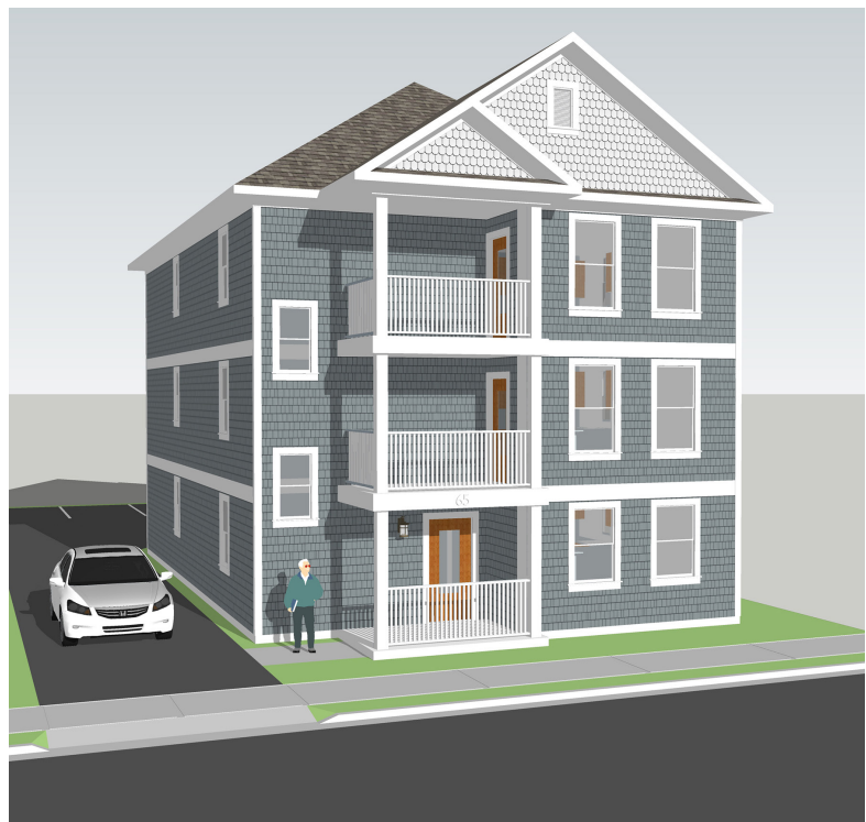
View of the proposed development from Walker Street