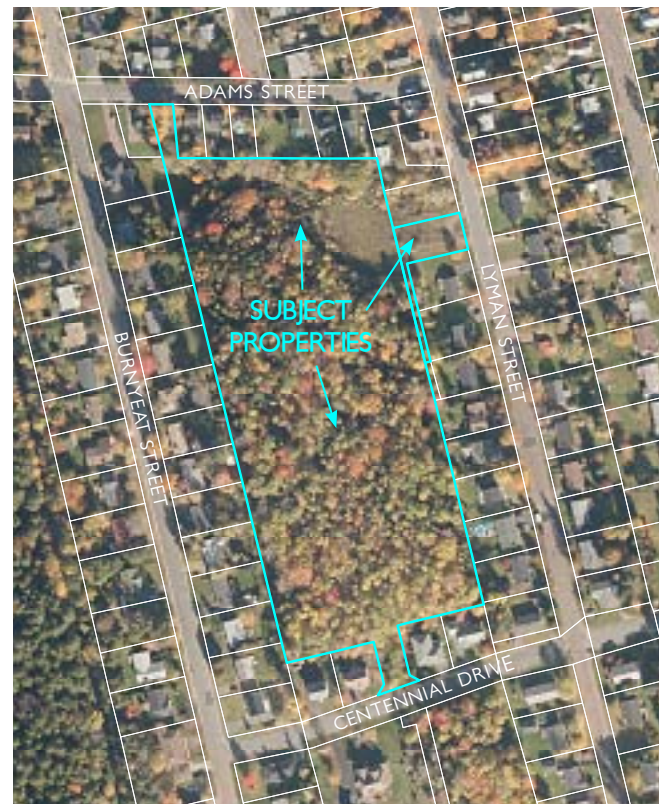
Air Photo showing the subject property and surrounding area

Unlike earlier proposals by Brentwood, this development is to be accessed from Centennial Drive. Connections to municipal water and sewer, however, are provided using the Lyman Street frontage. Even