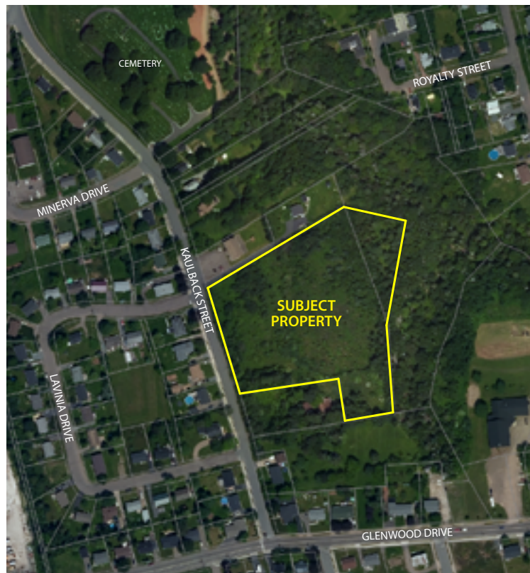
Air Photo showing the subject lands and surrounding area

This section of Kaulback Street is primarily residential and consists mostly of single detached dwellings. There are two and three unit residential conversions nearby as well as several multiple unit buildings in the vicinity, including a 6-unit building situated immediately to the north of the property on Kaulback Street. A church property lies opposite Doggett Brook to the east.