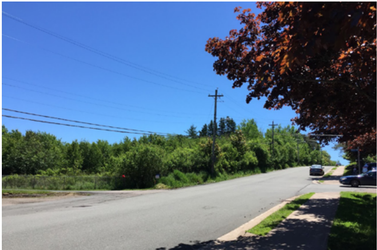
View of the Subject Lands looking southeast from Kaulback Street, taken opposite the 6-unit residential building located at 165 Kaulback