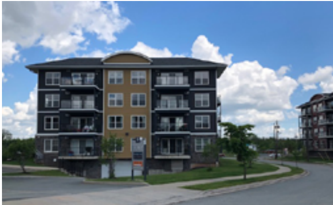
Photos of a development in Elmsdale submitted by Brentwood Developments Limited to illustrate the exterior appearance of the proposed buildings

The proposed buildings are situated approximately 8 metres (26 feet) from neighbouring properties to the north, south and east. The buildings are situated 10 metres (33 feet) from Kaulback Street. The site plan shows a treed buffer, approximately 2 metres (6.6 feet) wide along the property lines where the development abuts neighbouring residential uses at 171 and 201 Kaulback.