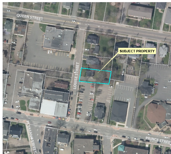
Air Photo Showing the subject land and the surrounding area

The subject property was purchased by the applicant in 2005 and is currently vacant. It contains a single family home and the rear of the property is developed as a garage. A small green space is situated in front of the dwelling and a few mature trees are located around the garage. It also features two mature trees and a fence along the south property line. Although there are a few single family homes to the north side of the subject property, the land use