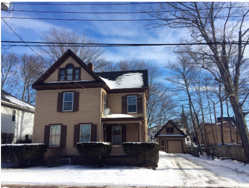
9 Louise Street looking east from Louise Street