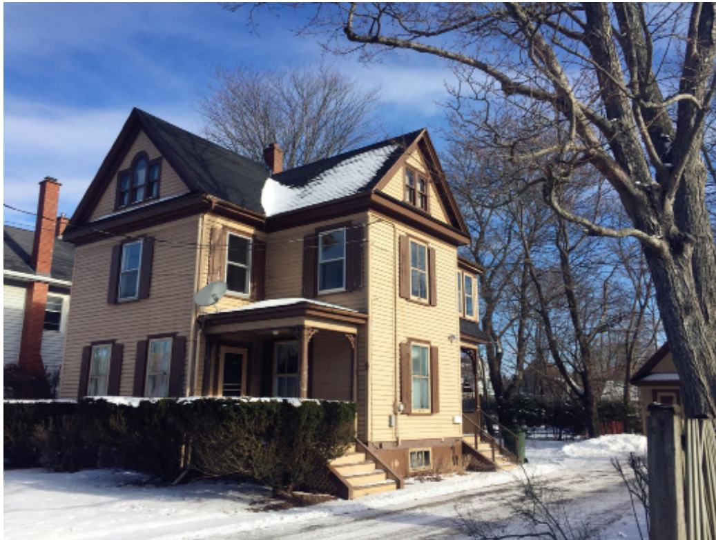
9 Louise Street looking northeast from Louise Street

Zone (C1) to the south side. Two photos of the subject property and an excerpt from the Town's zoning map are showing below.