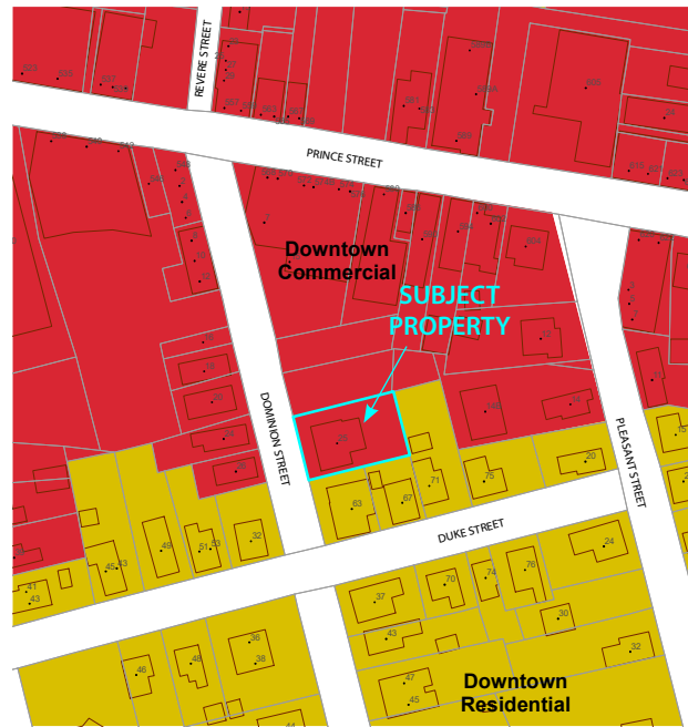
Future Land Use map of the subject property