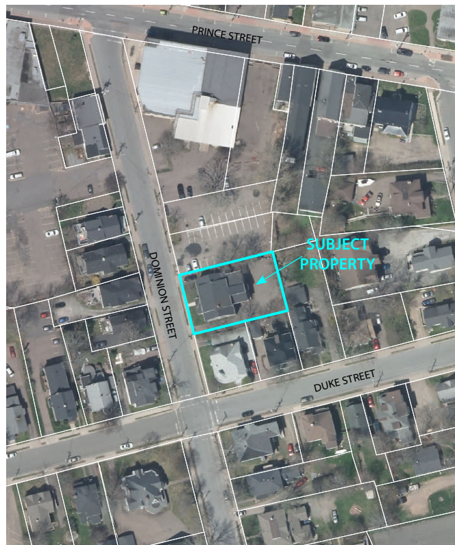
Air Photo showing the subject property and surrounding area

The subject property is 25 Dominion Street, also identified as PID no. 20181897. This parcel is 2560 m 2 (8400 ft 2 ) in area and has 23.3 m (76 ft) of frontage on Dominion Street. The property is zoned Limited Commercial (C2) and is situated in the Downtown Commercial Future Land Use Designation. 25 Dominion is currently developed and contains a 2.5 storey structure with a ground floor area of approximately 257 m 2 (2767 ft 2 ). The Town's property