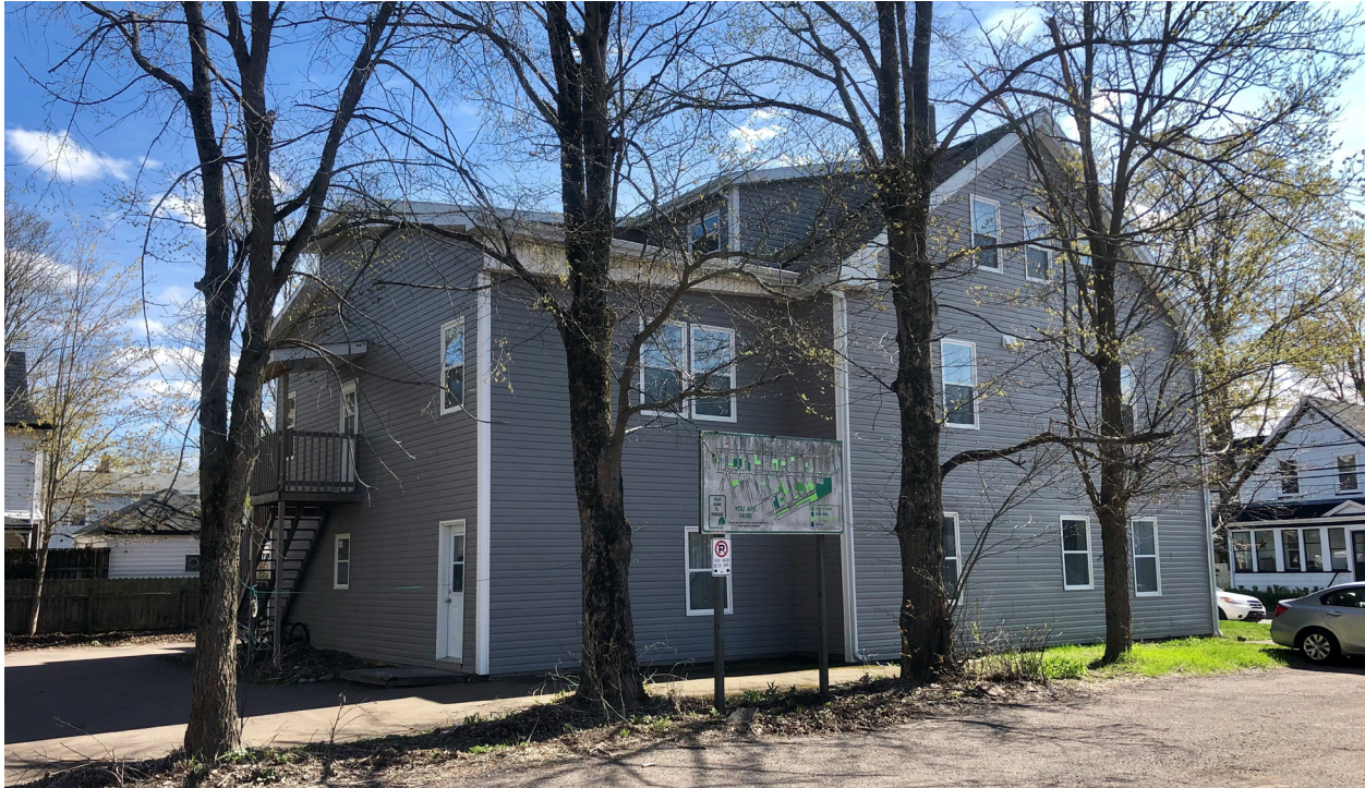
View of 25 Dominion looking south from the Town owned parking lot adjacent to the subject property