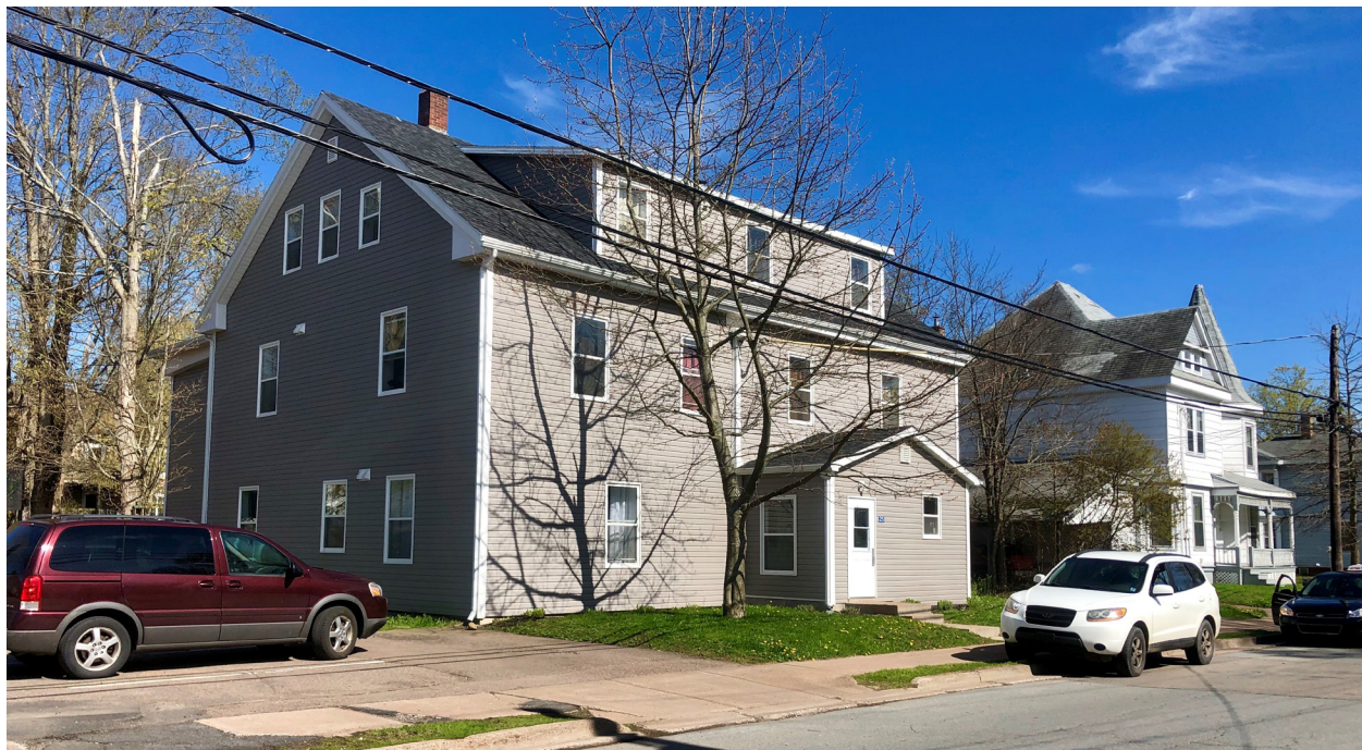
View of the subject property looking southeast from Dominion Street